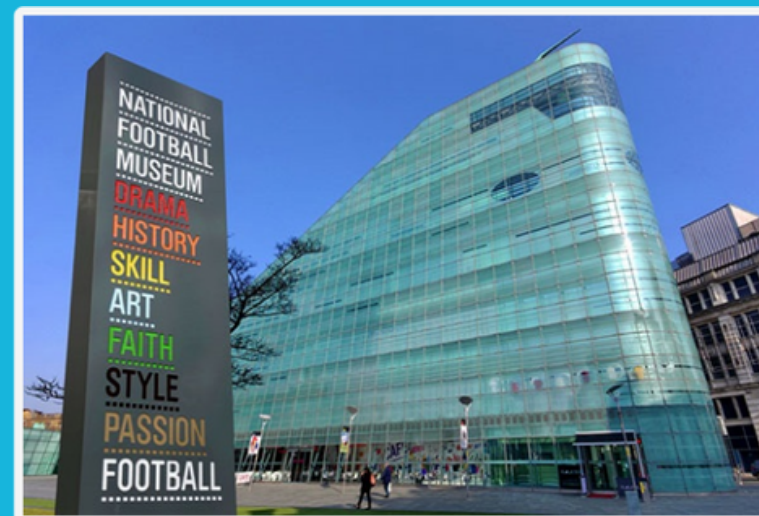
National Football Museum