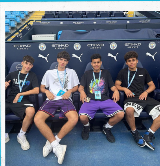
Etihad Stadium Tour